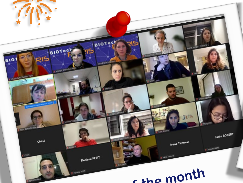
Event of the month